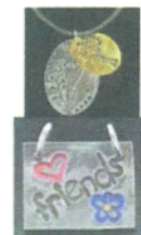
June 19 Charms with Gold

Class Dates and Times: all classes start at 1:00 pm